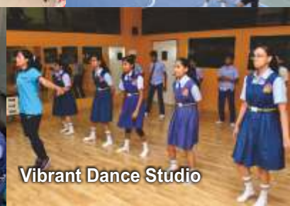
Vibrant Dance Studio