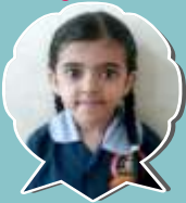
Mirunalaya Thasma Winner Mathlete State level Trophy Std - II