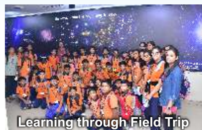
Learning through Field Trip

Student led learning : Student engagement is a central component to our philosophy. Classrooms are designed around the learners' needs with clear-cut boundaries and expectations. Learners are encouraged to be self-aware and take the initiative for expressing their needs. Students are encouraged to find their strengths and mistakes are recognized as powerful teachable moments. Teachers lead, coach and motivate learners to be in charge of their own learning.