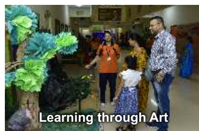
Learning through Art