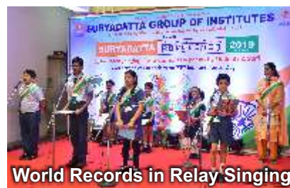
World Records in Relay Singing