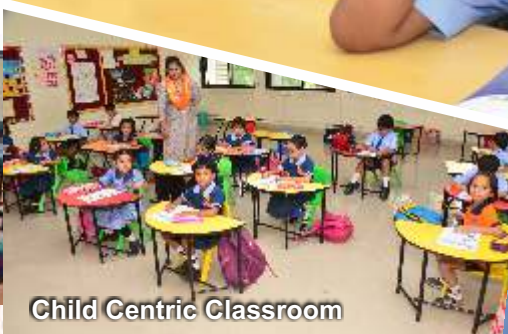
Child Centric Classroom