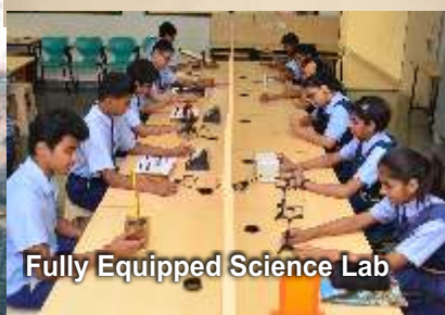
Fully Equipped Science Lab