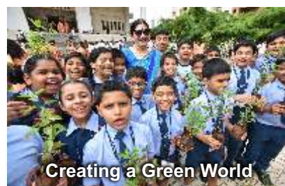
Creating a Green World