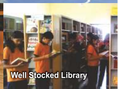
Well Stocked Library