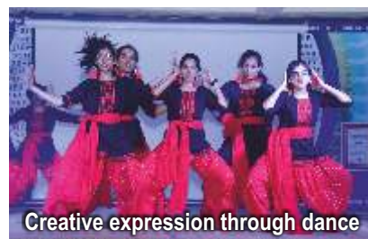
Creative expression through dance