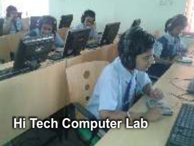
Hi Tech Computer Lab